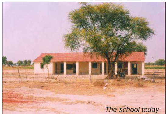
The school today