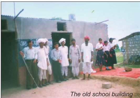
The old school building

This was done in conjunction with contributions that came from the tourist travelling with Far Horizon Tours visiting the school and with additional funding from Far Horizon. These tourists were from USA (Overseas Adventure Travel). Pictures as below.